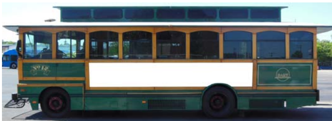
ROAD SIDE PANEL