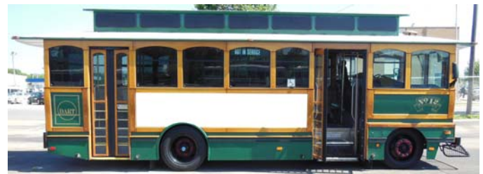
PASSENGER SIDE PANEL